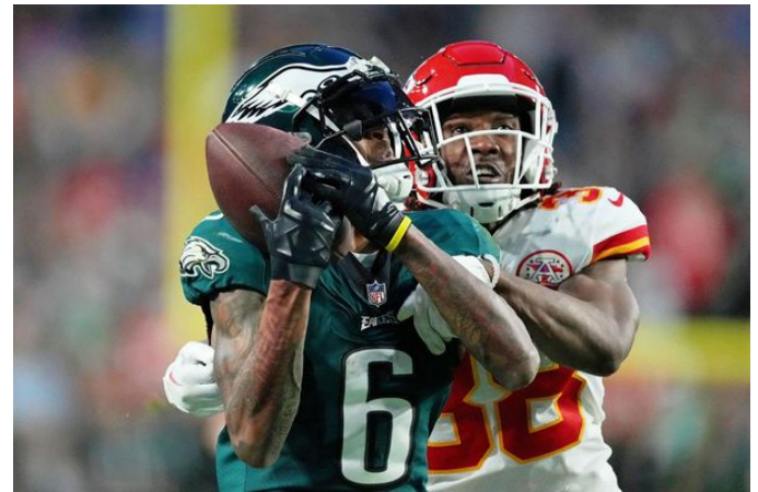
DeVonta Smith of the Eagles and L'Jarius Sneed of the Chiefs.