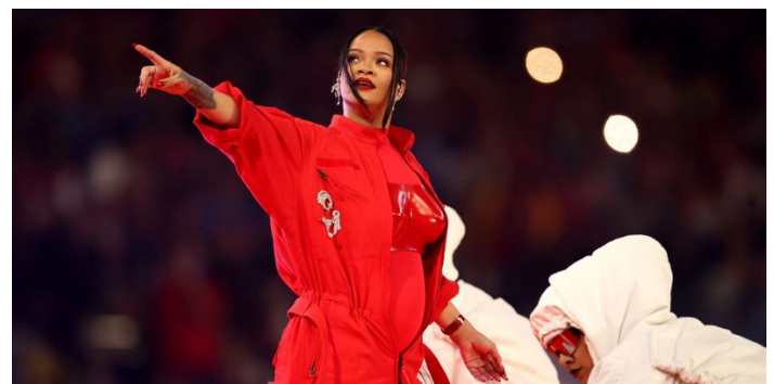
Rihanna performing at the halftime show.