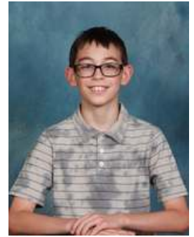
Aryn Huffman Feature Writer