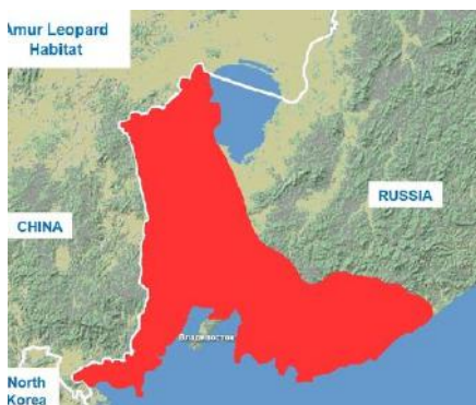
Amur Leopard habitat.