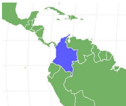
Cotton-top Tamarin habitat.